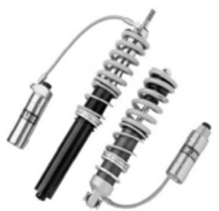
Ohlins Double Adjustable Motorsport Shocks

These are the same units the pro teams use on their GT3's. With multiple wins at LeMans, Daytona 24 hours and countless others, you simply can't buy any better.