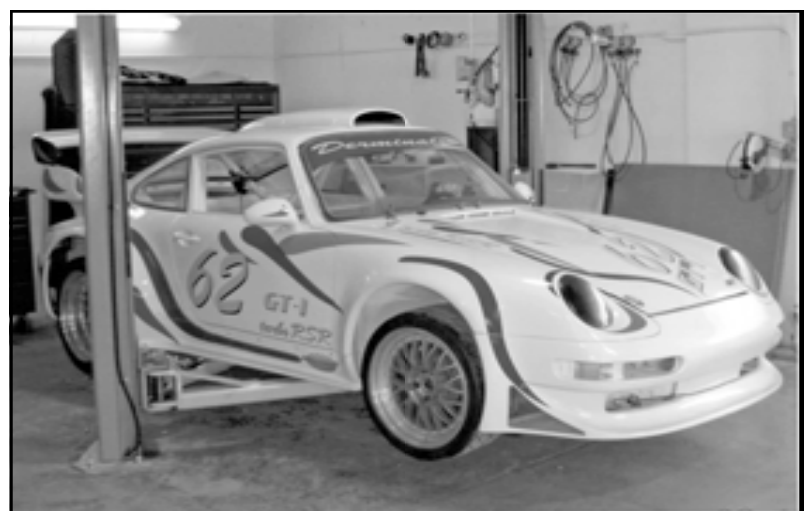
Figure 1: Marcia and Pat's Enduro Pit Stop Log

REWARD for information concerning a missing 1997 Porsche 911 RSR club racing car – last painted white with #62 ("Derminator2" or "D2"). Last seen in Beatrice, Nebraska in April 2008 [Shamrock/Cahill]. Roll cage serial number 493 100 601. PLEASE CALL DAN PAPE AT (800) 522-3070 WITH ANY INFORMATION – REWARD.