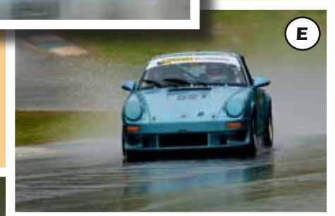
C - Craig Finley (North Florida) #711 GTC4 D - Deems Riddwle (Tennessee) #155 GT6S E - Delbert Auray (Connecticut Valley) #521 D