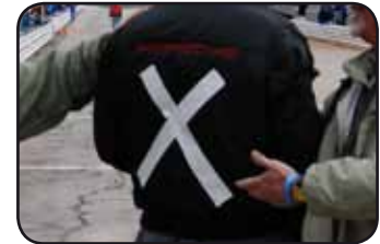
Mr. "X" - Page 4