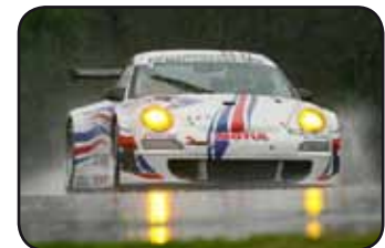
Peachstate 225 - Page 24