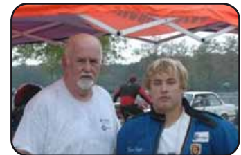
A New Generation - Page 22