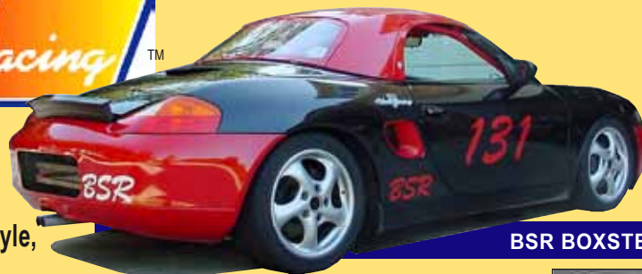
BSR BOXSTER SPEC RACER

13 year national sponsor of PCAClub Racing.