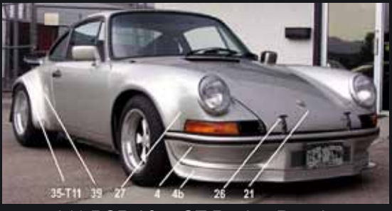
911 RSR After GT Racing Panels Parts 35-T11, 16A, 39, 27, 4, 4B, 21 and 26