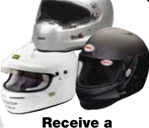
Helmet Bag & Ground Shipping* with each helmet purchase!