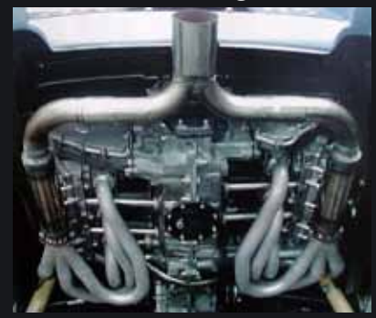
Mandrel Bent 911 RSR Headers with Silencer / Stinger Exhaust