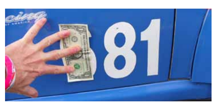
The Dollar Bill Te$t revisited If you can cover a car number with a dollar bill, your car number is not compliant